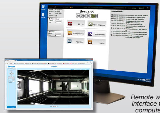
Remote web interface for computer