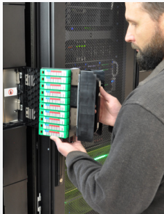
Loading ten tapes at a time