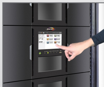
Convenient front panel color touchscreen

Easy to use and manage, the library's management software provides a similar feature set as the rest of the Spectra tape library family, including an intuitive color touchscreen, remote web interface, ability to create partitions (up to 20), built-in diagnostics, media lifecycle management, encryption, and encryption key management. An optional SpectraVision web camera can be mounted on top of the library to provide a visual assessment of all robotics and interior components.